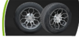
12" Aluminum wheel 205/50R12