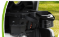
Golf bag holder and storage basket