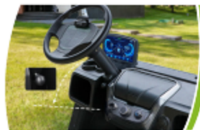
Adjustable steering column