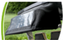
Golf bag cover with retractable mechanism