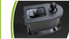
Golf ball washer