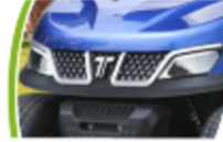
LED headlights /Taillights