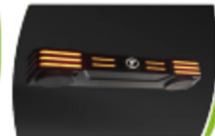
Cuboid sound bar