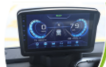
9" Bluetooth touchscreen