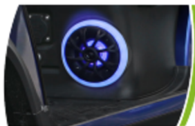
Stereo system with lights