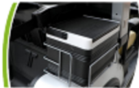
Caddy master cooler